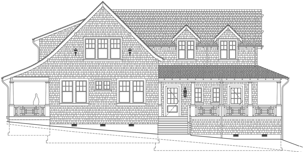
4 EAST ELEVATION LOT 7 1/8" = 1'-0" SCALE