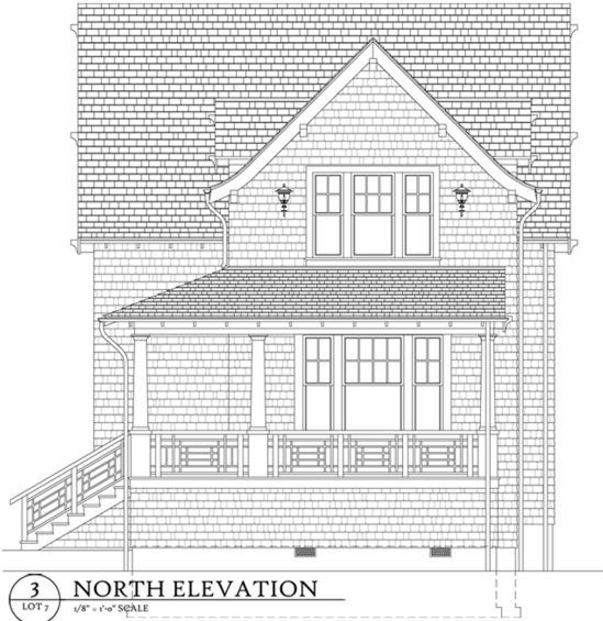
3 NORTH ELEVATION LOT 7 1/8" = 1'-0" SCALE