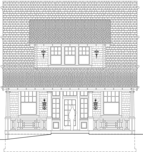
3 SOUTH ELEVATION LOT 7 1/8" = 1'-0" SCALE